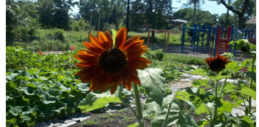
Cottageville Park Neighborhood Garden

at 325 Blake Road N. After the lease of the current tenant expires in three years, the District plans to remove the building as part of its plans to restore the health of the creek and to sell the remaining land to be redeveloped.