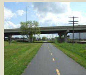
Cedar Lake LRT Regional Trail in Hopkins

When the trail ends near Hwy 169, you can connect with other trails heading north or continue west all the way to Eden Prairie. With amenities such as this, the Blake Road neighborhood is a convenient place to live! For more information on the trail, visit the Three Rivers Park District website at www.threeriverspark.org .