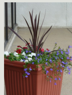
A potted flower placed in front of a local business on Blake Road.