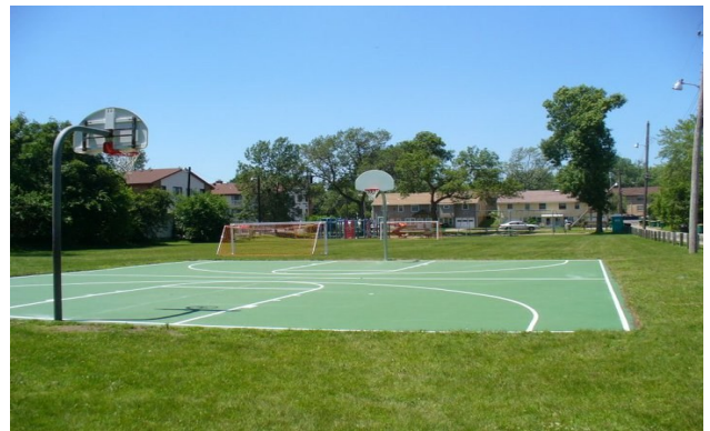
After: The court was expanded to full size and finished with a new surface and lines. A second hoops was also added. Now a full game of basketball can be played!