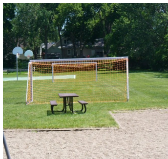
Pictures (clockwise) 1. Portable bathroom 2. Picnic tables, soccer nets, and basketball court 3. New garbage bins

next summer and ready for use. In the meantime, be sure to stop by and check out the new and improved park!