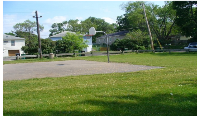
Before: Cottageville Park had only one hoop with half of a court.

Along with these improvements to the basketball court, a portable bath- (Continued on next page)