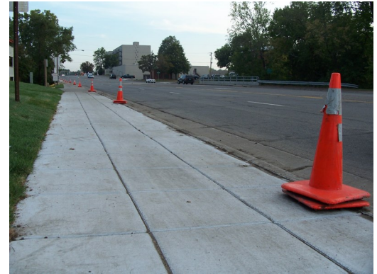
Blake Road Corridor