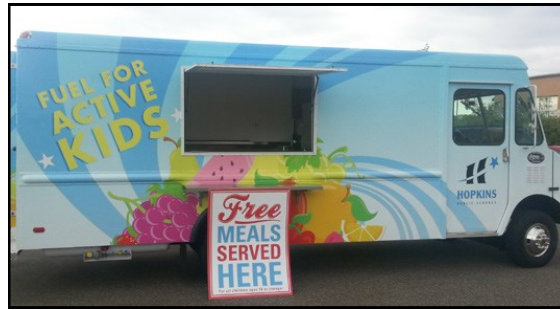
Hopkins Schools Food Truck

The Playground Program is available for youth ages 6-12 each weekday afternoon Monday through Friday from 1:00-4:00pm. This program includes physical activities, arts & crafts, and visitors from the Hopkins Fire and Police Departments. Youth can attend the entire time or drop-in whenever possible. This program will conclude with an end-of-the-season carnival on July 22. To register, call (952) 939-8203.